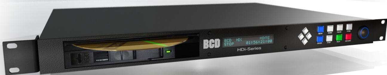
BCD HDi-250 High Definition Industrial Video Recorder

The BCD HDi is a series of versatile disk-based video recorders designed for industrial, scientific, educational and military video recording. The HDi-250 answers many of our customers' requests for features like: